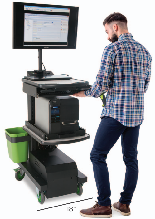
NB Series SLIM shown above with optional second shelf, slide-out printer tray, post-mounted flat screen holder and keyboard tray

All NB Series Mobile Powered Workstations listed below come standard with (one) adjustable height shelf, 5" locking casters, front push handles, integrated power system and power strip, wastebasket and holder.