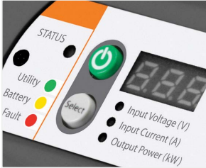
Remote battery/inverter status meter

With the largest range of accessories, the NB Series can accommodate almost any profile of workstation including those with scales, testing equipment, large monitors, barcode printers and even laser printers. At the end of use, simply plug your cart into a standard wall outlet to recharge.