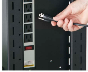
Integrated power strip