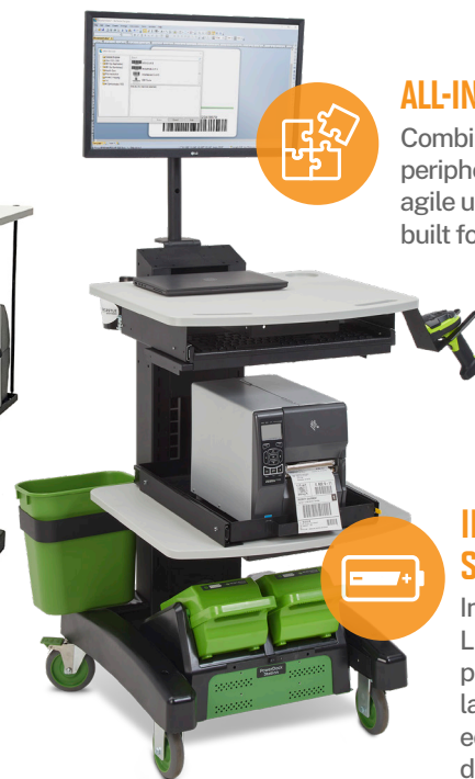
SHOWN: MID-RANGE NB SERIES CART WITH NUCLEUS LITHIUM POWER SYSTEM