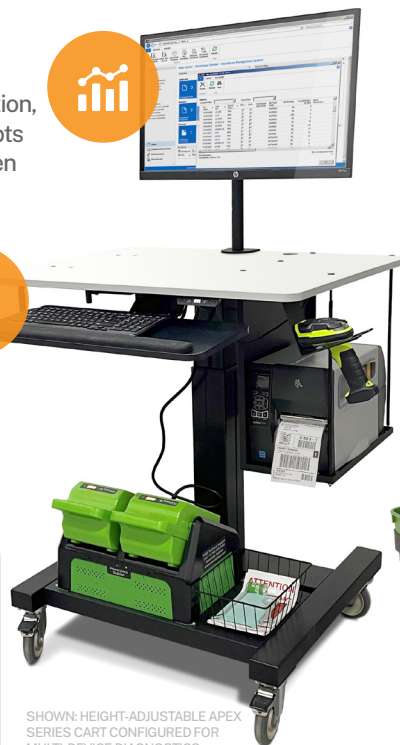
SHOWN: HEIGHT-ADJUSTABLE APEX SERIES CART CONFIGURED FOR MULTI-DEVICE DIAGNOSTICS

Newcastle Systems Powered Carts are the next generation of crash carts — transforming reactive recovery into proactive uptime. Whether maintaining security compliance, configuring new servers, or responding to unplanned outages, your team can now work where the work happens. Contact us today!