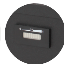
Visual and audible low voltage alert