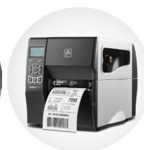
PowerPack 4.0 powers mid-range printer for 6-8 hours (dependent on number of labels printed)