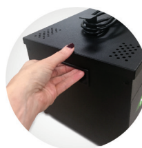
Easy grip side handles for true portability

Special Lithium feature: PowerPack Ultra Lithium comes bluetooth-enabled for real-time stats via its own app. Data includes charge level, cycle life and more. Available for Android and Apple.