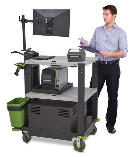
PC Series workstation, 30" (762 mm) shelf unit with optional accessories

All PC Series Mobile Powered Workstations listed below come standard with (one) adjustable height shelf, 6" locking casters, push handles, integrated power system and power strip, waste basket and holder.