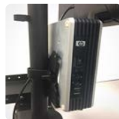
Thin client and CPU mounts