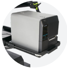
Optional slide-out printer tray