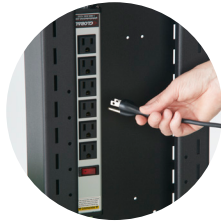
Integrated power strip