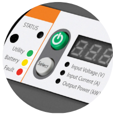
Remote battery/inverter status meter