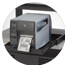
Optional printer shelf