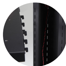
Slotted support mast for adjustable shelves