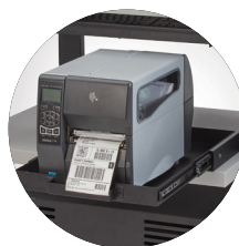
Optional printer shelf