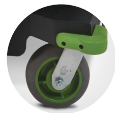
Specialized casters make cart movements smooth and easy

All PC Series Mobile Powered Workstations listed below come standard with (one) adjustable height shelf, 6" locking casters, push handles, integrated power system and power strip, waste basket and holder.