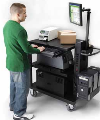
Mobile Powered Workstation with Integrated Power Package