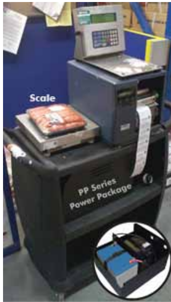
Mobile Weigh & Label Station At Restaurant Depot

Although the PPP is relatively new to the market, it is not brand new. It has proven its effectiveness in several applications. For example, Restaurant Depot, a members-only wholesale supplier of food, equipment, and supplies to restaurants, designed a PPP-equipped cart that is already used by more than 80 businesses. The cart, which contains a PPP with a