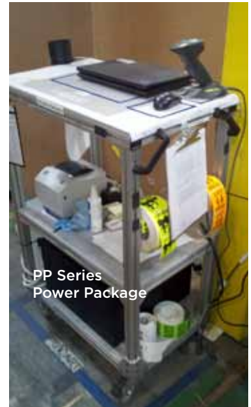
Mobile Problem Solving Station at Amazon.com

A PPP-equipped cart with a wireless computer is really a mobile workstation. Capitalizing on the benefits of auto-ID technologies, it integrates the facility’s software with devices on the cart to establish a mobile on-demand label printing station, a mobile shipping/receiving station, and so on.