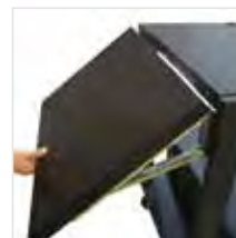
Folding Shelf for PC Series