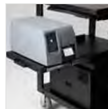
Slide-Out Printer Tray for PC Series