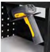
Scanner Holder for NB, PC & RC Series