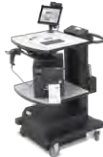
NB Series Mid-Range Unit