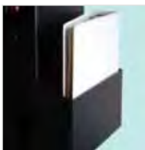
Binder Holder for NB & PC Series