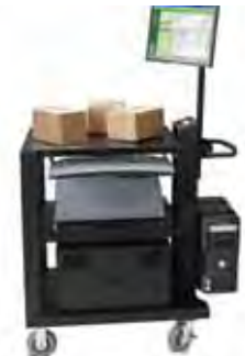
PC Series Heavy-Duty Unit