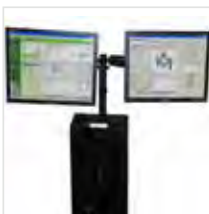
Single & Dual Monitor Mount & 30" Pole for NB & PC Series