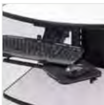
Adjustable Keyboard Tray with Mouse Tray for NB & RC Series