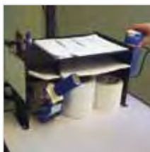
Desk Organizer for NB & PC Series