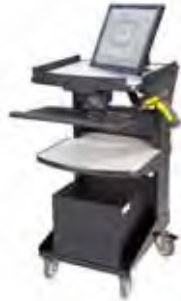
RC Series Entry-Level Unit