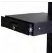
Lockable 3" Drawer for NB & PC Series

A sampling of the currently available accessories is pictured below. You can find the complete line of modular accessories at www.newcastlesys.com/accessories .