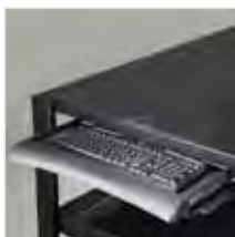
Keyboard Drawer for PC Series