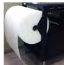
Bubble Wrap Holder for PC Series