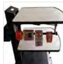
Label Holder for NB & PC Series